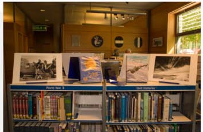
Images from the day at the library.