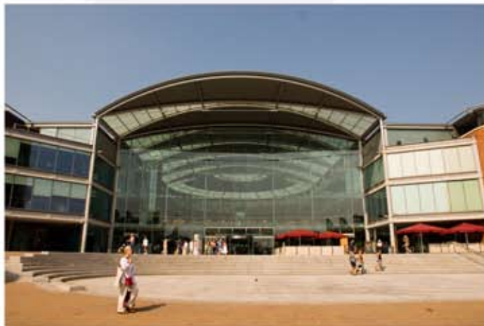
"The Fourm" where the Library is housed.

To know that this book will be seen by all that come in and out of the library, to read and see all that dad and his crew succeeded in accomplishing while flying their B-24 Liberator from Tibenham, for me is quite an honor.